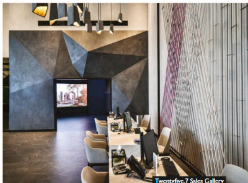
Twentyfive.7 Sales Gallery

with lush frondescence into its structure. The result embodies flowing lines in the reception area that mimic the surface movement of water, accompanied by walls with wooden textural elements and tropical greenery that breathe the entire area to life. Included in the design is a forest-themed 'experium' dark room, an exhibition space containing three-dimensional maps and models, a sunset lounge and discussion area, a premium lounge, a forest-themed kids play area, a luxurious multi-purpose hall, as well as well-appointed back offices.